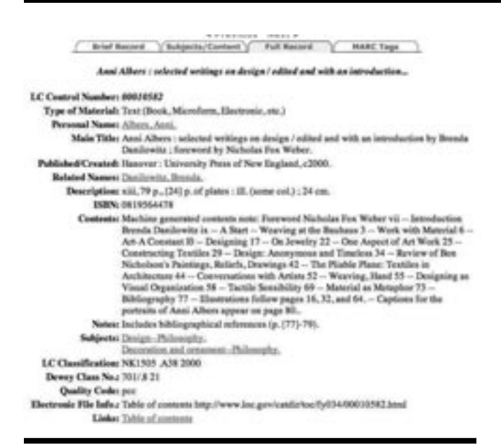
Figure 7. Sample bibliographic record with machine-generated TOC