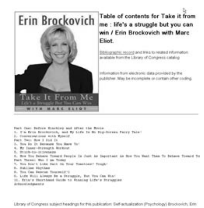
Figure 6. TOC for Take It From Me , together with image of the book jacket

Publishers' ONIX files vary in the amount of information they contain. The information is not aimed at library use but is intended for the book trade, so information