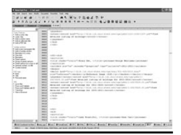
Figure 1. NoteTab Interface Showing Tagged EAD Markup

The EAD specialist, after consulting the RLG Best Practices Guidelines for EAD and the Best Practices of the Online Archive of California, circulated a document to curators explaining what would be needed in order to make the finding aids ready for EAD markup.6 Particular stress was placed on the fact that these finding aids would be presented on the Web to an audience unfamiliar with local holdings and institutional practices, so that the broader top-level information would be essential. In addition, this information would help to shape each finding aid into a truly hierarchical description. Conforming to these standards would ensure not only that finding aids were good candidates for EAD markup, but that the necessary elements for useful MARC records would also be in place. It was hoped, through collaboration, to reduce the need to repeatedly follow up with curators and archivists in search of more descriptive information.