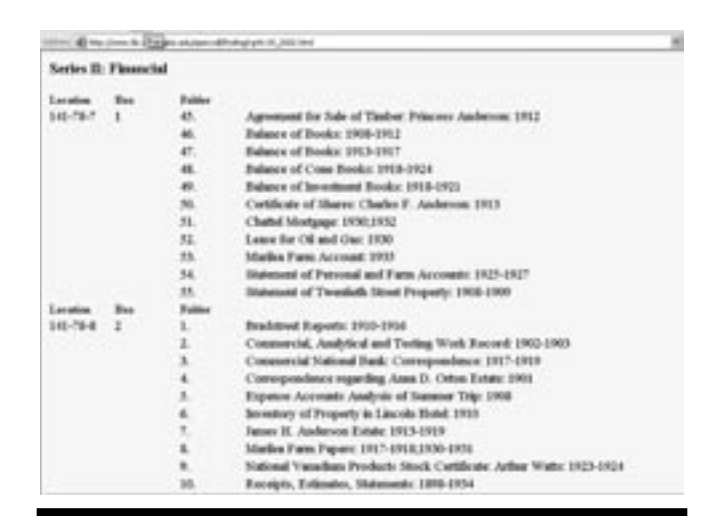
Figure 3. Finding Aid with Box and Folder List

Another staffing issue was addressed by training student assistants to use the encoding templates. The interface needed to be simple enough in its presentation so that student employees without any previous experience with XML or EAD could successfully use it. The authors were pleased to find that, with one to five hours of training (depending on the complexity of the encoding), student staff were able to successfully use the NoteTab