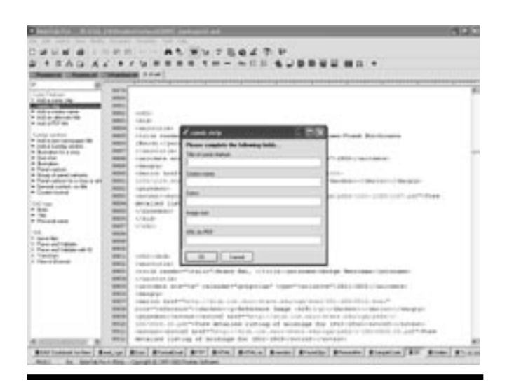
Figure 2. NoteTab Interface Showing Input Dialog Box

It should be noted that some finding aids were simply too idiosyncratic to be restructured into regular data fields; extensive rewriting would have been necessary in order to prepare them for EAD compliance. These were rejected for this project. The finding aids ultimately chosen for the sample group were those with high research value that could, with a reasonable amount of effort, be restructured in accordance with EAD.