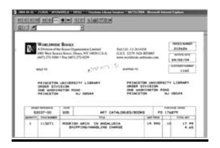
Figure 2. Sample Scanned Document

The issue of how staff work with paper is less well defined. The significance of paper as a symbol in the workplace should not be discounted. "Paper as a symbol of the old-fashioned past is rooted in some real issues having to do with costs and interactional limitations."8 In this case, management clearly viewed paper as a symbol of a less efficient, more expensive past, but staff appeared to have differing views. Paper is a familiar technology and does not require staff to invest in rethinking the way they work. The success of such a sweeping change in the way work is done by staff requires agreement and acceptance at all levels of the hierarchy.