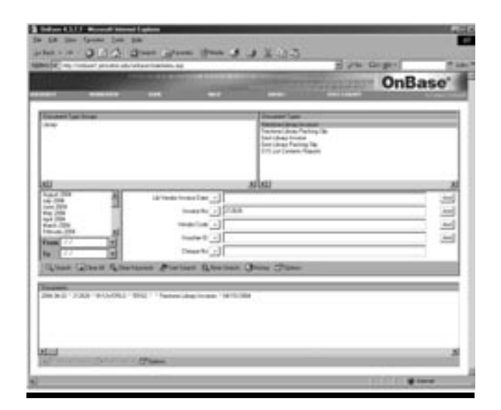
Figure 1. OnBase Web Interface

The flowchart shows three points of entry for invoices with the "invoice in the package" route accounting for the largest percentage. But there is overlap; invoices may come in first-class mail and then again with the package, or invoices may come in a package and by EDI. Multiple instances of the same invoice mean that care must be taken to avoid duplicate scans of the invoice and to identify as already scanned any transmission documents traveling with material to be processed.